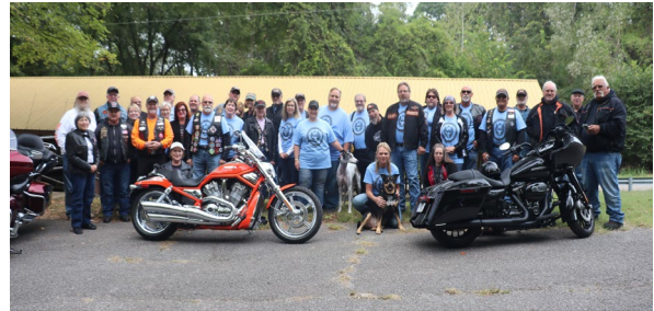
HOG Waller Group Photo 2018